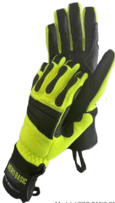
Model: HERO BASIC GREEN

Brand fibre made from 100% Nomex III® orange, fluorocarbon impregnated Basis weight approx. 185gr/m2 approx. 8 cm long Nomex® Comfort knitted cuff; basis weight approx. 450gr/m2